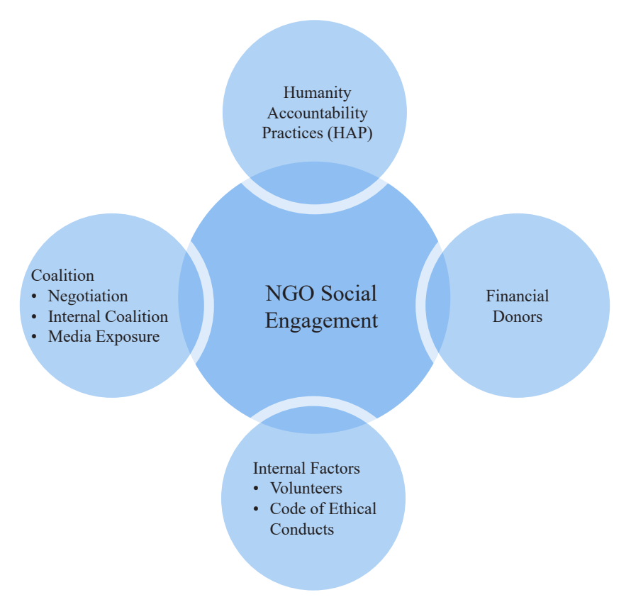
Figure 2. Diagram represents NGO Social Engagement in MERCY Malaysia

beneficiaries as a legitimate form of discharging accountability in line with NGO representatives such as HAP (Awio et al., 2011; Connolly & Kelly, 2011; Hasan & Siti Nabihah, 2012; Rahman & Hussain, 2012). The diagram to summarise the findings can be reflected as follows: