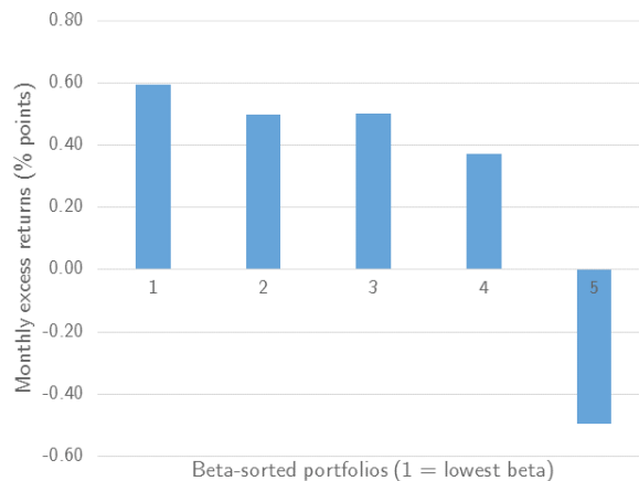
Figure 2. Monthly excess returns of beta-sorted portfolios. This scatter diagram plots the average monthly excess returns for beta-sorted portfolio over the period of January 2004 to December 2015. Excess returns are calculated as the monthly return minus the one-month Thai Treasury bill rate, presented as percentage points. At the beginning of each calendar month, stocks in the Stock Exchange of Thailand are ranked based in ascending order based on their estimated beta at the end of the previous month. All stocks are given equal weights within each portfolio, and portfolio are rebalanced every month. Portfolio 1 contains stocks