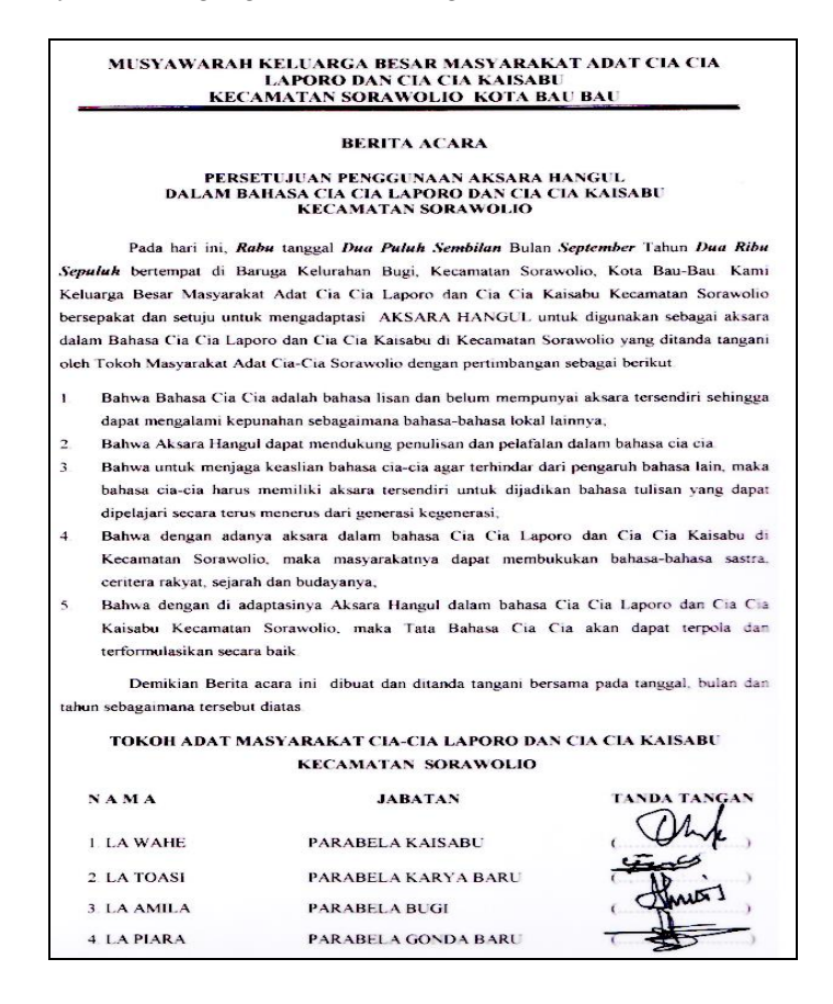
Figure 4. Written agreement in its original form

of Education also passed a law that enhanced English language classes. Consequently, local language education began to decline once more.