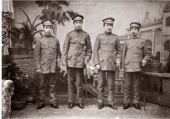
Figure 4. The first one on the right was Lin Sen and next to him was Wu Tiecheng. They were wearing their revolution clothing in 1910 (source [with permission] from the Overseas Chinese Association webpage " Chuanghui Lishizhang Wu Tiecheng Zhaopianzhan 创会理事长吴铁城照片展 Photos Exhibition of the Founding President Wu Tiecheng")