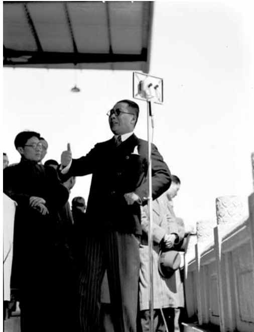
Figure 3. Wu Tiecheng (behind the microphone) at Shanghai Children's Day on 4 April 1936

Wu Tiecheng (or Wu Te-chen 吴铁城) (1888–1953), Cantonese, a native of Pinghu Village ( Pinghuxiang 平湖乡), Xiangshan County ( Xiangshanxian 香山县) which is present Zhongshan County ( Zhongshanxian 中山县), Guangdong (广东), was born at Jiujiang (九江), Jiangxi (江西). He was introduced by Lin Sen (林森) to join the Revolutionary Alliance ( Tongmenghui 同盟会) in 1909. After the 1911 Wuchang (武昌) Uprising until the early 1930s, Wu took up various important party and state positions at Jiujiang Military Government, Sun Yat-sen's (孙逸仙) Military Government, Sun Yat-sen's Presidential Office, Generalissimo's Headquarters, Xiangshan County, Canton City, Guangdong Province, Nationalist Government, Kuomintang (KMT) and other offices. He had been to Japan and Honolulu before returning to China in 1916. In the late 1920s, Wu began to demonstrate his abilities as a negotiator especially in getting Zhang Xueliang's (张学良) support during the Central Plains War that broke out in 1930.