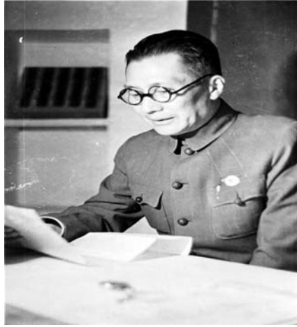
Figure 1. Wu Tiecheng as Secretary-General of the KMT CEC broadcasting overseas on 30 May 1941