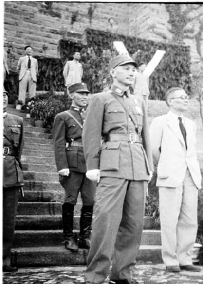
Figure 2. The first person on the right was Wu Tiecheng and next to Wu was Chiang Kai-shek. They inspected flag parade on 14 June 1943