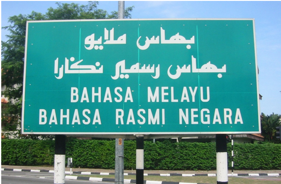
Figure 2. Road sign in BSB reminding people that “The Malay language is the official language of the country”