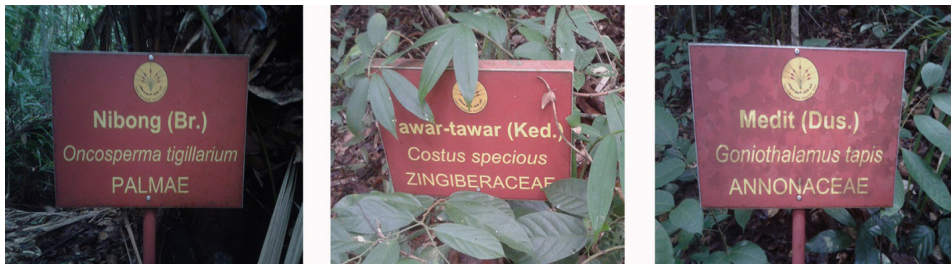
Figure 4. Plant names in Brunei Malay, Kedayan and Dusun respectively

In some places, attempts have been made to label plants with their traditional names. Figure 4 shows some plant labels found along the forest boardwalk near Tasek Merimbun, a scenic lake in the south of Tutong District. It is encouraging that such efforts have been made to preserve the traditional names of these plants.