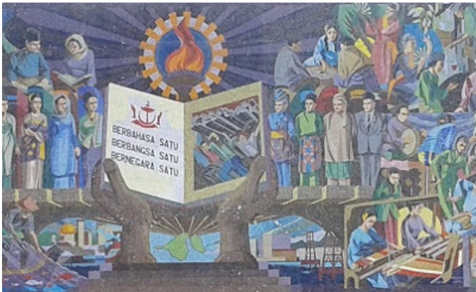
Figure 3. Mural on the national library in BSB promoting “one language, one race, one nation”