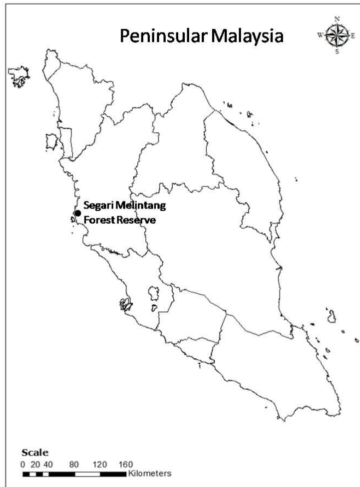
Figure 1: Location of the Segari Melintang Forest Reserve, Perak, Peninsular Malaysia.

The study site was located at the Segari Melintang Forest Reserve, Perak, near the village of Teluk Senangin (Fig. 1). Its main vegetation type is lowland dipterocarp forest, and there are patches of alluvial fresh-water swamp along its edges. The reserve currently comprises 2742 ha, of which 407 ha is strictly protected virgin jungle reserve (VJR) (Perak Forestry Department, pers. comm.). A more detailed description of the study site can also be found in Ruppert (2014).