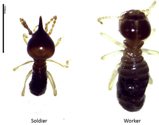
Figure 5: Soldier and worker Nasutitermes

caused by human activity often resulting in increasing termite species richness, abundance and function by providing more structural and physical complexity which provides microhabitats for termites (Jones et al. 2003).