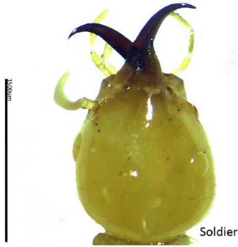
Figure 3: The soldier head of C. curvignathus