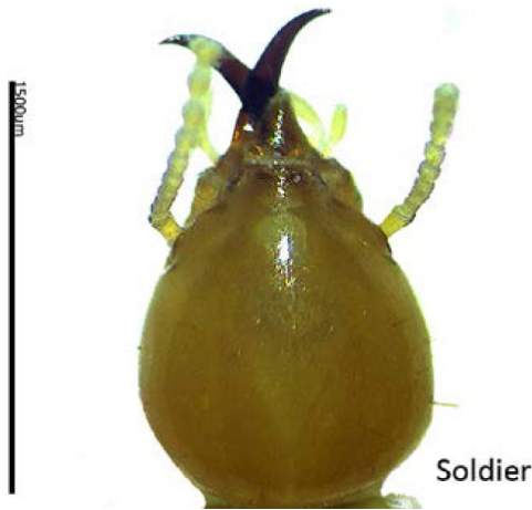
Figure 4: The soldier head of C. sepangensis

Further statistical analysis of Chi-square showed that the p -values of each data observed is smaller than \alpha = 0.05 (Table 3). This indicated both termite feeding groups and subfamilies are significantly different with the termite species as shown in Table 3.