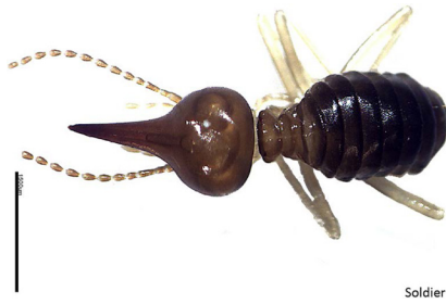
Figure 6: Soldier of Havilanditermes