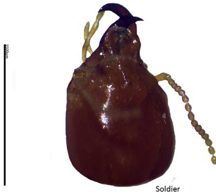
Figure 7: Soldier head of Scheidorhinotermes spp.