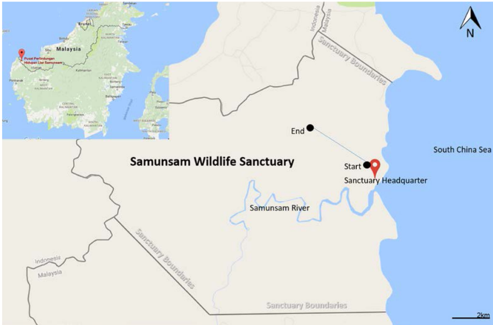
Figure 1: Samunsam Wildlife Sanctuary location.

About 10 to 20 termite soldiers were collected from each colony found during survey. The termite specimens were collected and kept in small vials with 70%–80% ethanol. The termite species identification was made in the Parasitology Laboratory, Universiti Malaysia Sarawak following Tho (1992), Thapa (1981), Gathorne-Hardy (2004), Syauckani and Thompson (2011) and other relevant publications.