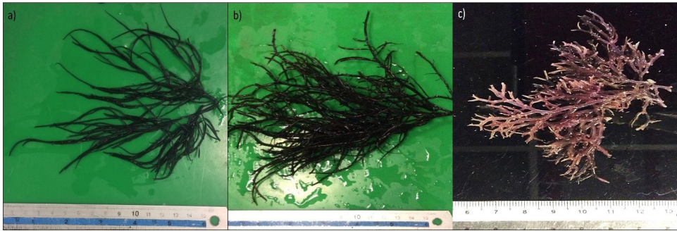
Figure 2: (a) G. blodgettii , (b) G. changii , (c) G. coronopifolia .