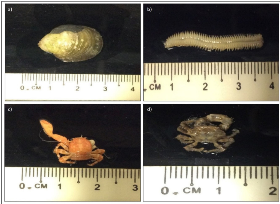
Figure 3: Aquatic macroinvertebrates (polychaete, small crab, bivalve) found living together with Gracilaria assemblages in Santubong.