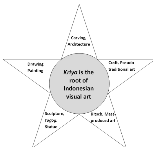
Figure 1 Kriya is the root of Indonesian visual art.

Kriya is an Indonesian icon, it is also mentioned as Indonesian mosaic whose development is inseparable from the nation's economy. In this responsibility, the excavations of traditional art in the form of pseudo traditional art nurtured it (Soedarsono 2002). Apart from that, its novelty demands were also the trigger for kriya to develop the economy based on creativity, skills, and individual talents; to create individual creativity and power that has economic value; and affects the welfare of society. As an Indonesian art that grows and develops in tune with people's lives, kriya is presented to improve the quality of life both physically and spiritually, in order to achieve the ideals of the jagadhita of the Indonesian nation.