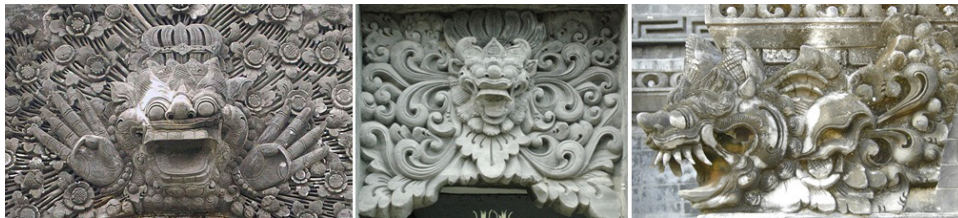
Photo 1 Karang bhoma, karang sae, and karang tapel.

unified as a whole. In every worship ceremony, there will be tetabuhan (traditional music) performed, songs, local customs, kriya , and other arts that are fully and coherently related (Ismail 1980). It is a beautiful and harmonious religious activity that is soothing, fun, and mesmerising. In Bali, kriya is a continuation of religion and it is a mean of ceremonies in another form. This makes kriya always enjoyable and developing for the religion needs in Bali. Shusterman (2008) further stated that religion has strict and a must or even cannot be violated rules, whereas art is the opposite. The presence of opposing or even contradictory concepts makes the art appear wild, free, rebellious, and angry, like the various forms of kriya that adorn various sacred places (temples) in Bali. The appearance of stylised various natural elements and visualised imaginary animals with violent, creepy, and frightening characters displayed various myths of the supernatural, which are terrible; but unique, interesting, and beautiful. Just look at how the karang bhoma on the Kori Agung (main entrance) of a temple, karang sae , karang tapel , and others, seems like they are waiting to grab and squeeze their prey for a meal. It turns out that behind these myths of horror, there are tenderness, kindness, and beauty. Kriya admonish mankind with its uniqueness and it is far more effective than long discourses. Thus, various kriya displayed in the temple to carry out their very adequate functions.