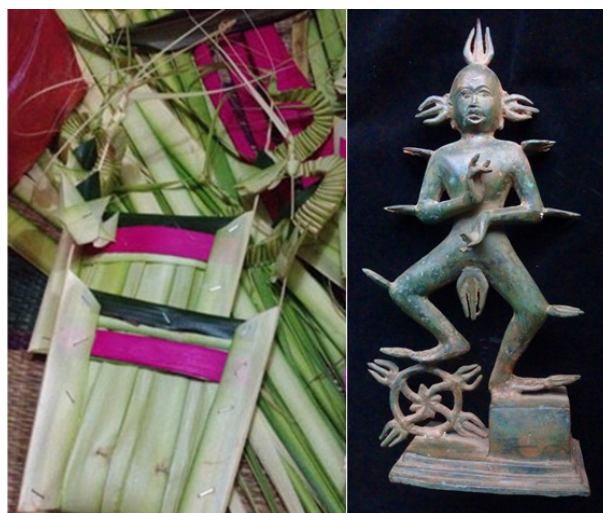
Photo 2 An example of jejahitan and pratima Acintya .

Kriya in the above function is the art of generating spiritual sense of the community, showing the true beauty of the concept of rwa bhineda . It is very apparent here that the concept of beauty and function is a concept of twins or identical intertwined (Suryajaya 2016). In Bali, religion, in this case Hinduism, gives a breath of life and enlightenment to the existing culture (Titib 2007). Religion and kriya synergise in such a way, intertwine like a weave, which reinforces one another inseparably. This braid can also be witnessed in various displays of kriya in the form of jejahitan (a series of janur or young coconut leaves as ceremonial equipment), pratima or statues (symbols of gods), and various other ceremonial equipment that are sacred to the Hindu community, those are what kriya meant.