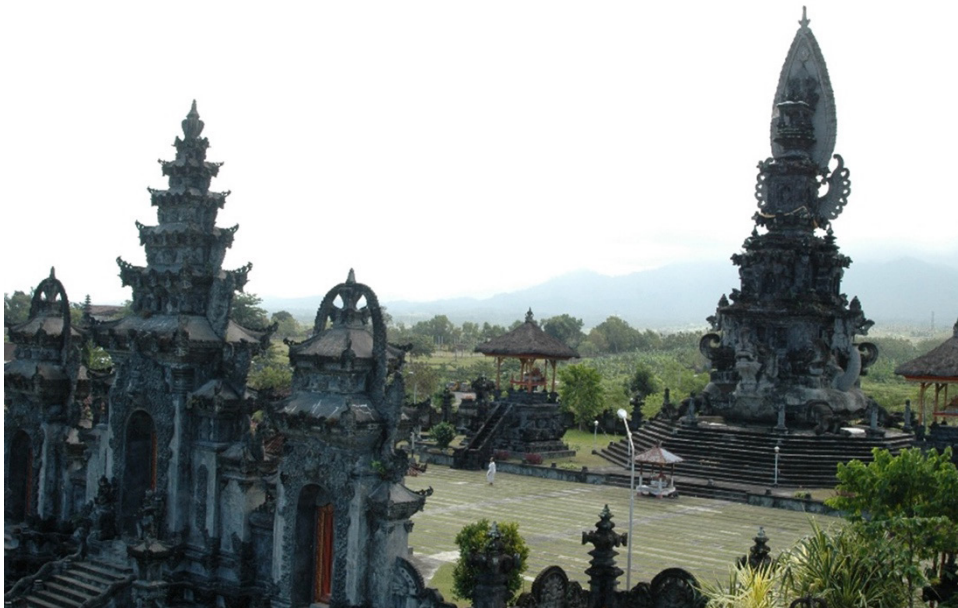
Photo 5 Temple that is sthana (dwelling place) of Ida Sang Hyang Widhi Wasa.

concept of Hinduism to beautify the temple is like self-dressing. The position of humans as a jagad alit is always alive, developing, and full of dependence on the jagad gede (the nature), while the jagad alit absorbs the jagad gede . This situation is a form of embodiment of the basic concept of Hindu community life in Bali. The concept is based on the rwa bhineda concept to lead to harmony and the balance of life on the principle of devotional service. In addition to temples appearing beautiful and magnificent, kriya makes it a heaven on earth and also increase the close ties of community solidarity. For this reason, kriya is not only for mere beauty and entertainment, but also as important religious goals (Haviland 1995). The temple as a holy place of origin, the temple for the lord of the ground, and finally the villager will later also worship the deified forefather, or clan and villager founder. The beauty of the temple shows the reciprocity between art and the collective awareness of the community. The appearance of the temple reflects the strength of the people's belief in their religion for sacred and magical purposes that are full of peace and natural both physically and spiritually (Soekiman 2000).