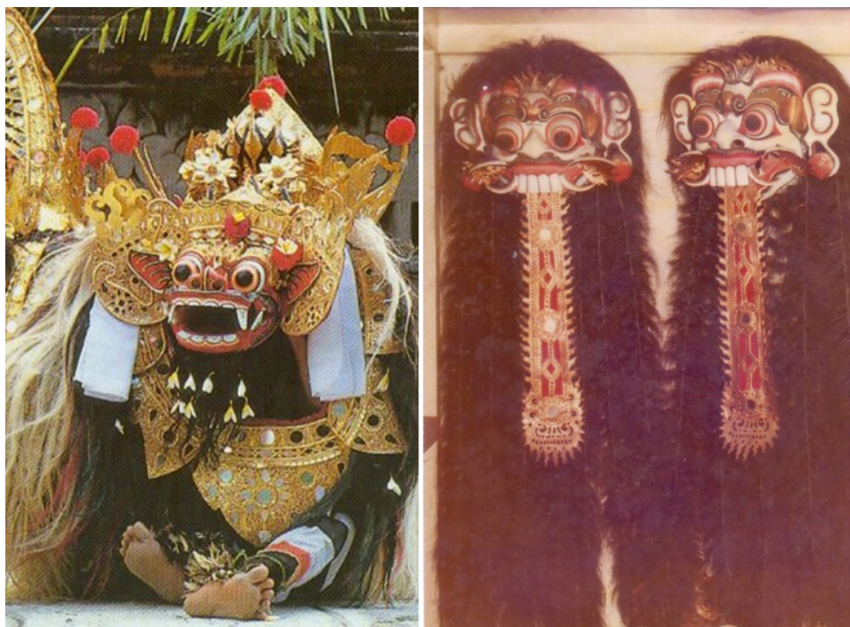
Photo 4 Barong and rangda — kriya in the concept of rwa bhineda (good and evil).