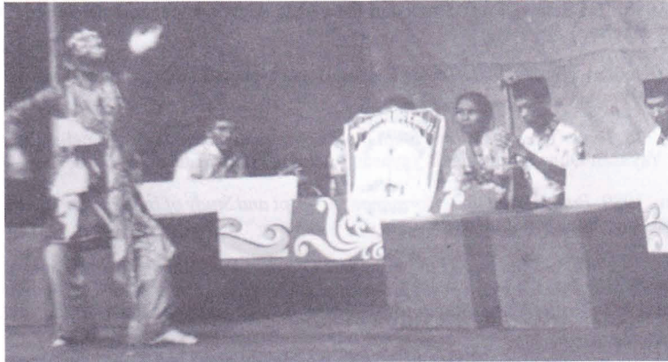
Photo 1 Betawi performance